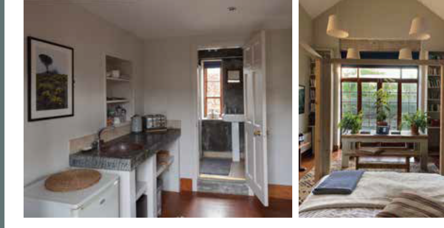
"The bed, which was a newly constructed four poster, was exceptionally comfortable. My husband reckons it is made out of scaffolding planks, which furthers the quirkiness of the apartment"